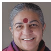
Vandana Shiva (India)