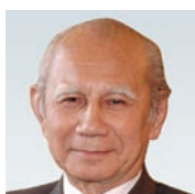
Emil Salim (Indonesia)

Chairman of the Advisory Council to the President of Indonesia Former Minister of State for Population and the Environment